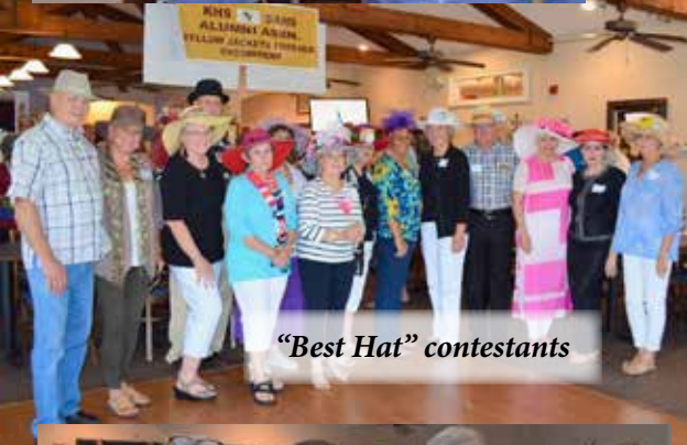
"Best Hat" contestants