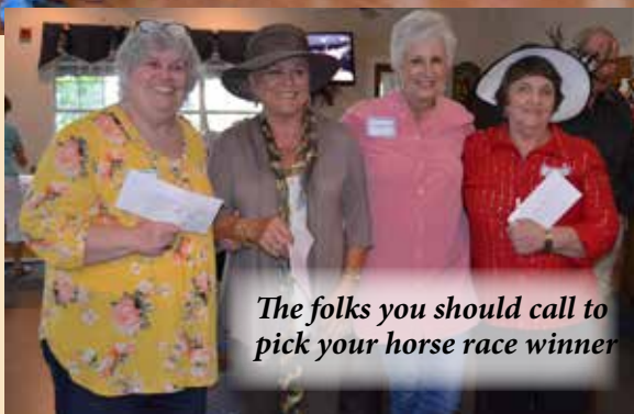
The folks you should call to pick your horse race winner